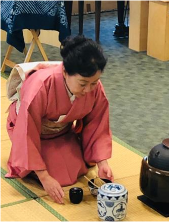
Tea powder is mixed with hot water and whisked.